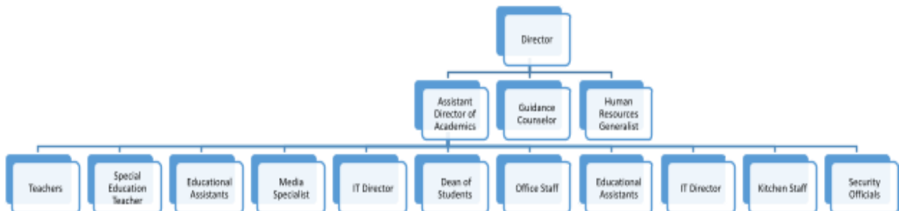
Ubah Academy Organizational Chart 2022-23

The UMA school board creates, sets and manages district policy, is responsible for district finance and its oversight, as well as the overall oversight of academic performance. The school board delegates to the district Director and administrative team the responsibility of everyday operational procedures. HR functions such as employment, employment law (state and federal), background checks, employee files, staff attendance, maintaining employee files, and facilitating benefits are delegated to the Human Resource Manager.